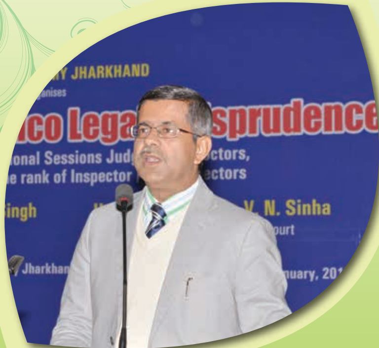
Justice is truth in action – Benjamin Disraeli