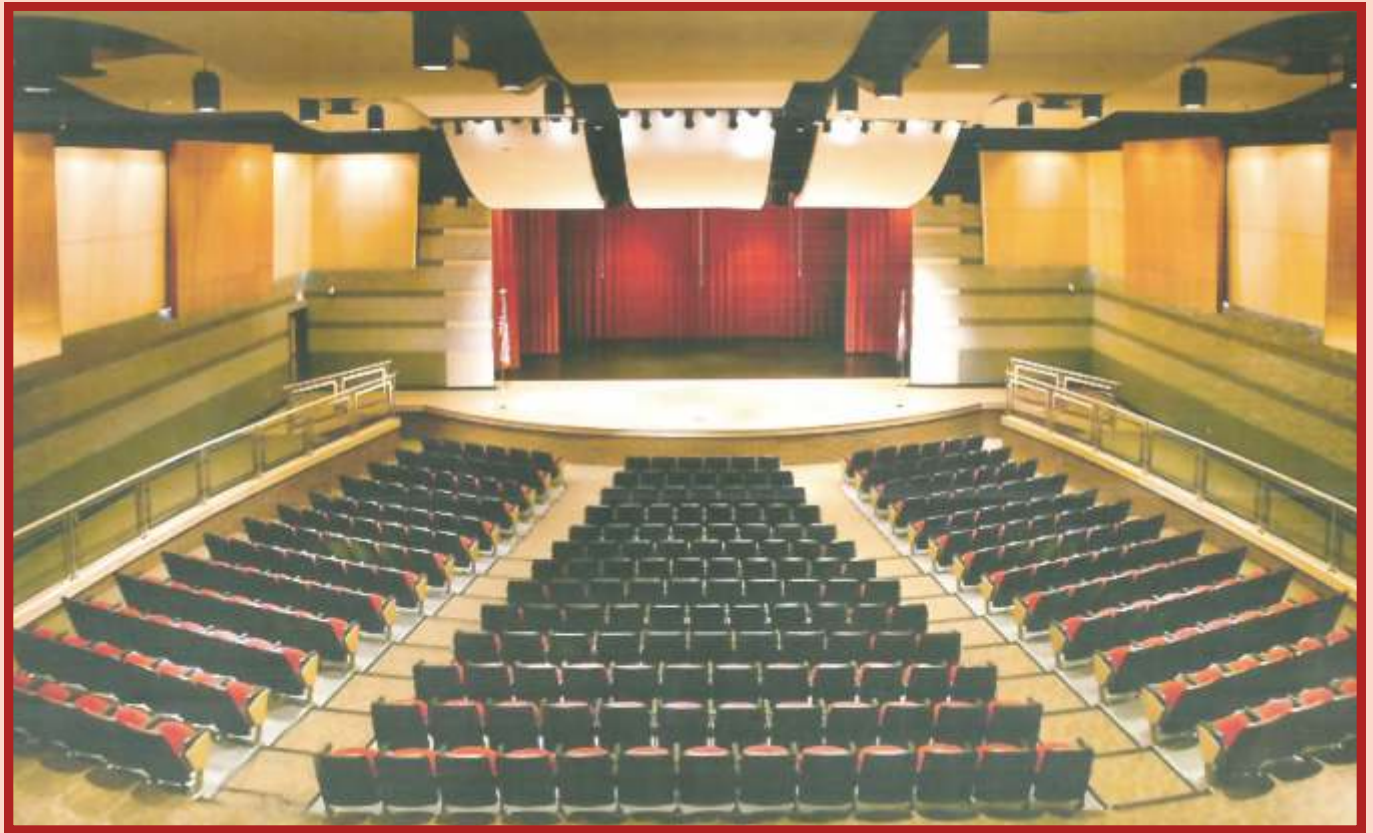
Auditorium of New Building of Judicial Academy Jharkhand