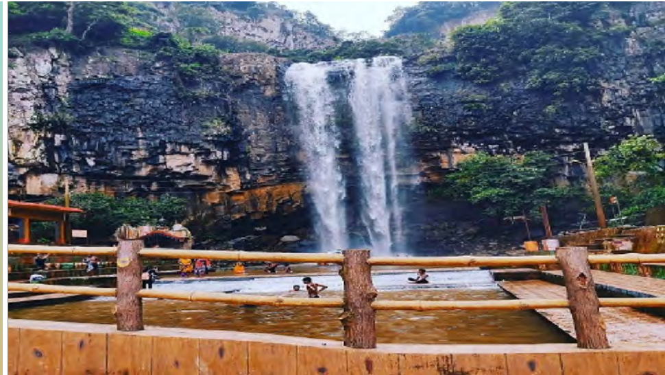
Stunning view of Moti Jharna, Sahibganj

Refresher Training on Civil Trial for Civil Judge (Sr. Div)