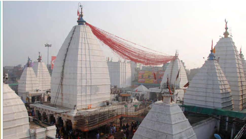
Baba Baidyanath Dham Temple of Deogarh: One of the famous Shiva Jyothirlingas