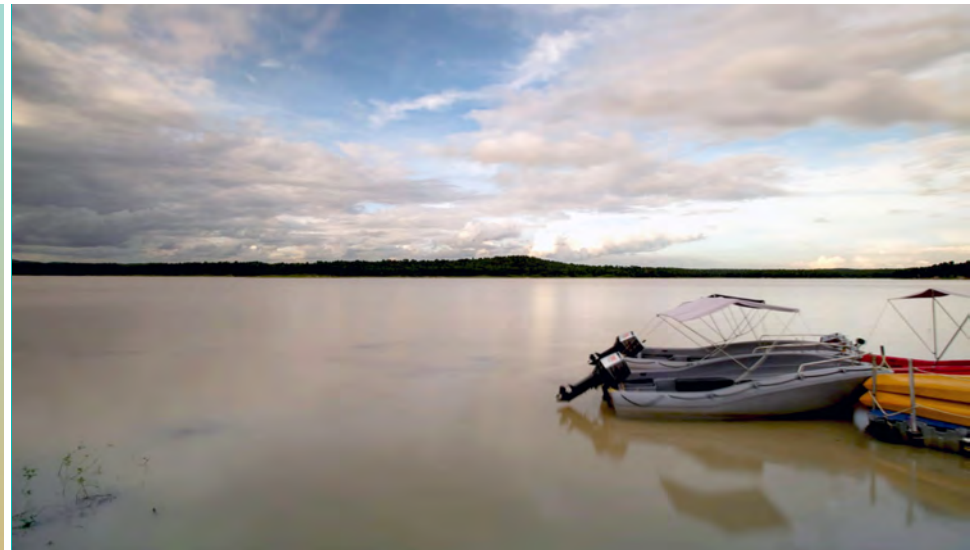
Picturesque scene of Latratu Dam at Khuti